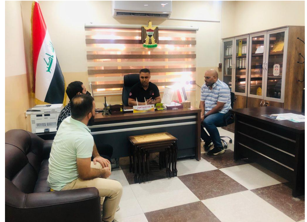
An interview to select young men and women of both genders to join the training workshops at the Ninawa Youth and Sports Forum - Ninawa, on 10/13/2021