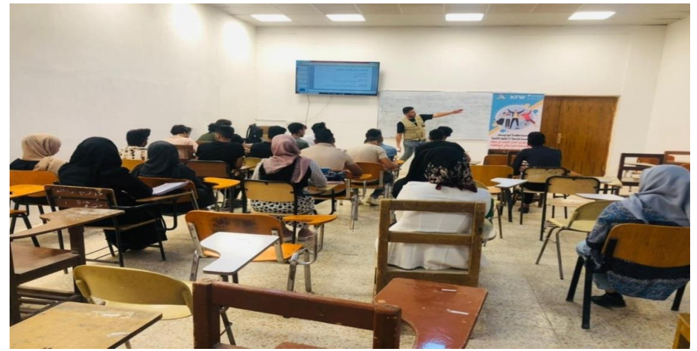
Peer to Peer Trainings in 3 Governorates