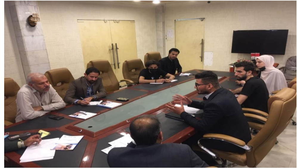
Youth meeting with the committee concerned with preparing and planning the budget in the Babylon Governorate office