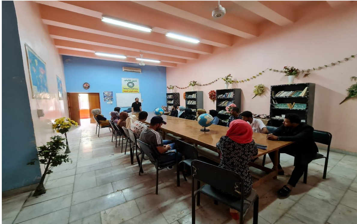
An interview to select young men and women of both genders to join the training workshops at the Musayyib Youth and Sports Forum - Babil, on 10/13/2021