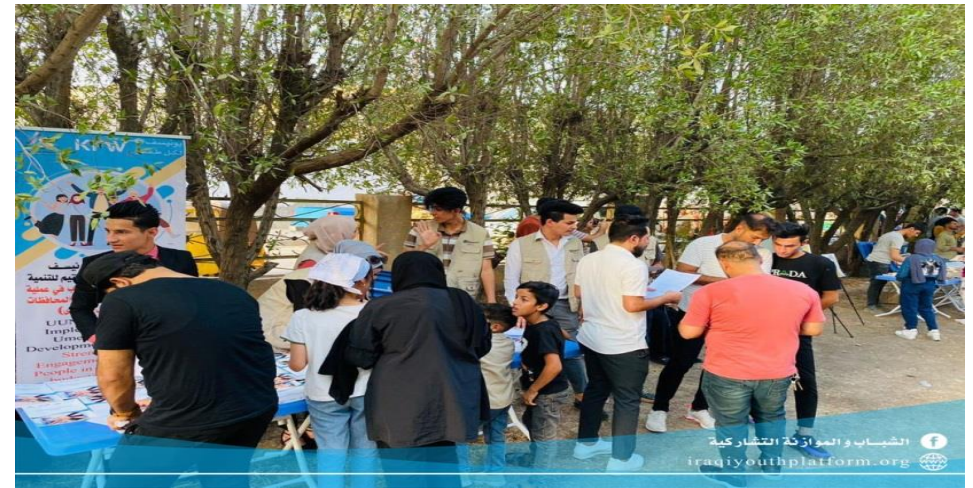
Youth Initiatives in Nenava and Missan