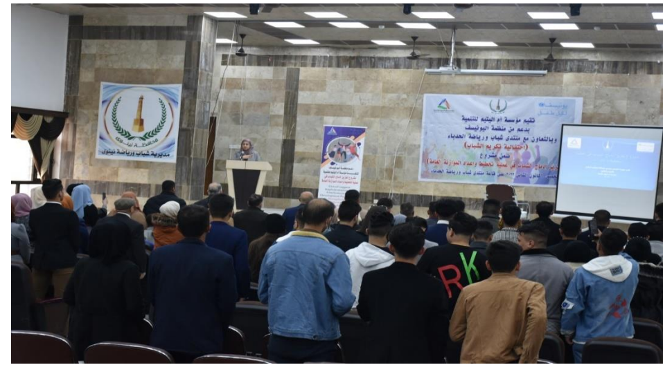
Youth Honor Ceremony (distribution of participation certificates) in Nineveh Governorate