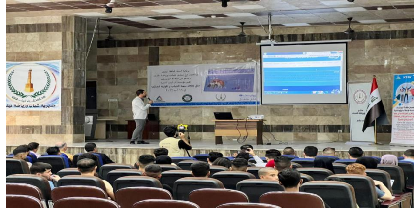
Launching the youth platform in Ninawa