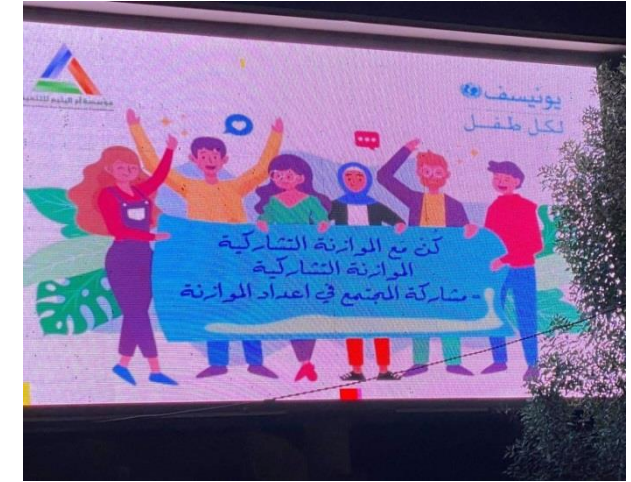
Advertisement in large screen in Babylon and Ninawa