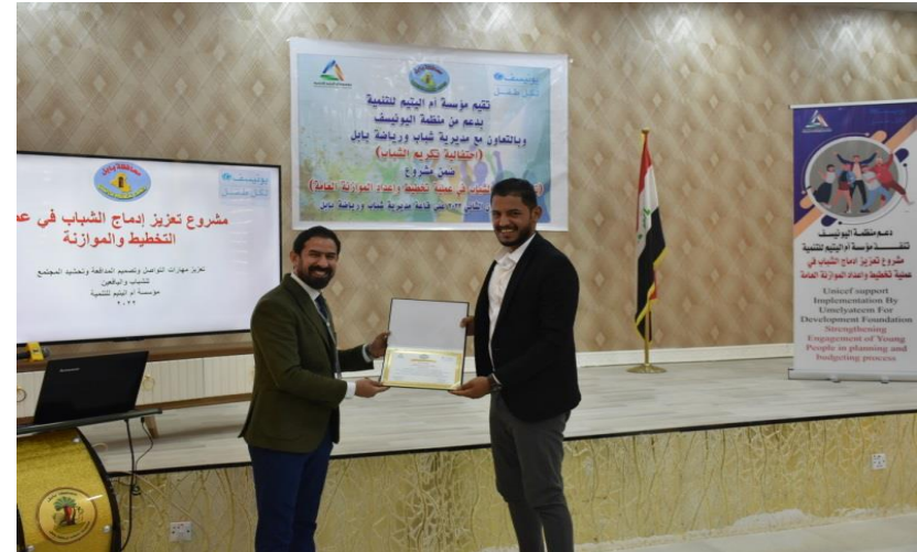
Youth Honor Ceremony (distribution of participation certificates) in Babylon