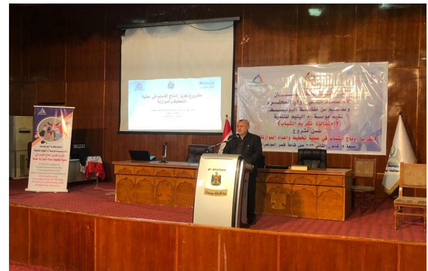
Youth Honor Ceremony (distribution of participation certificates) in Missan