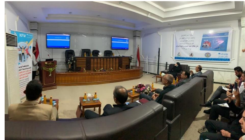
Launching the youth platform in Babylon